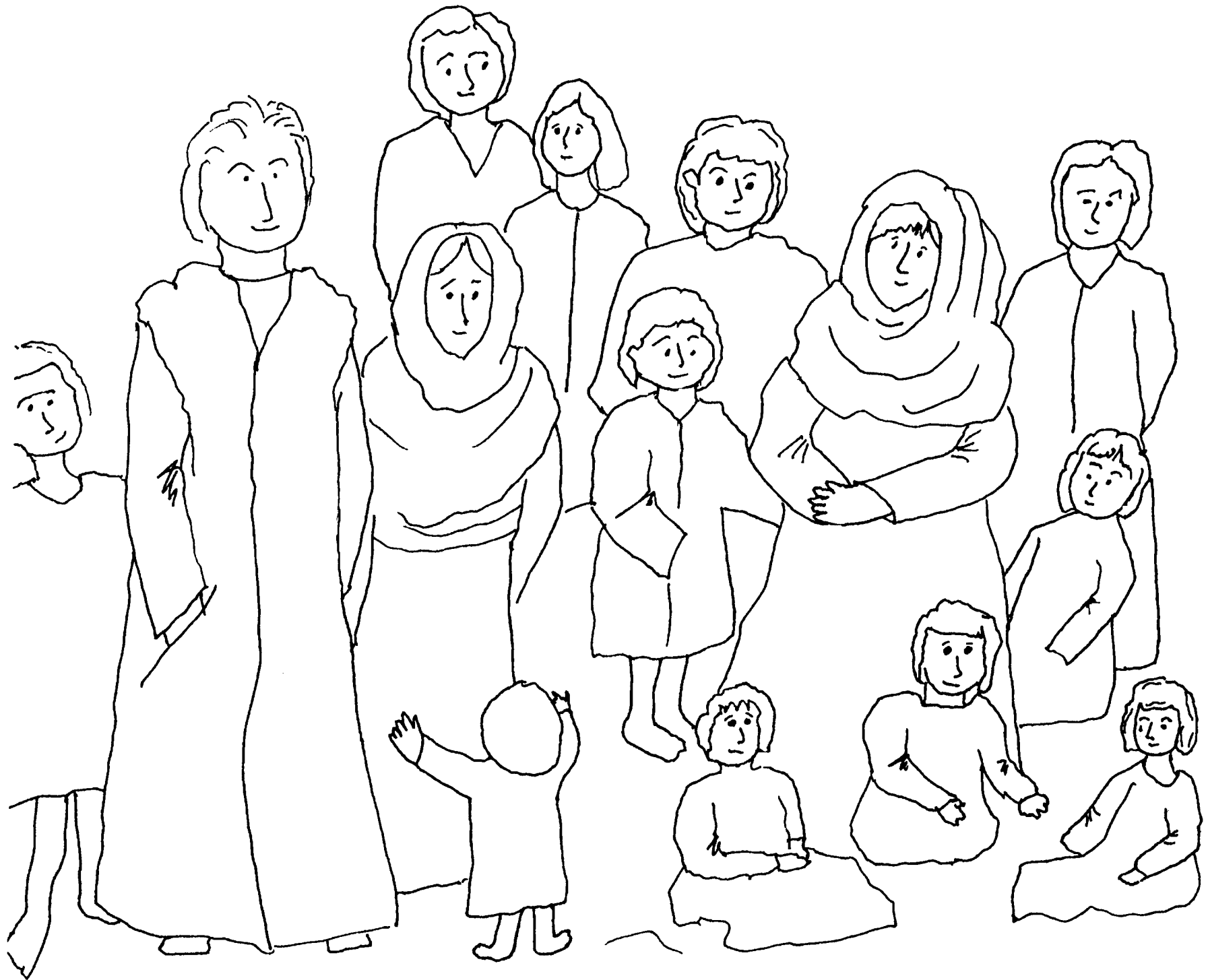
God blessed Jacob with a large family of twelve children.