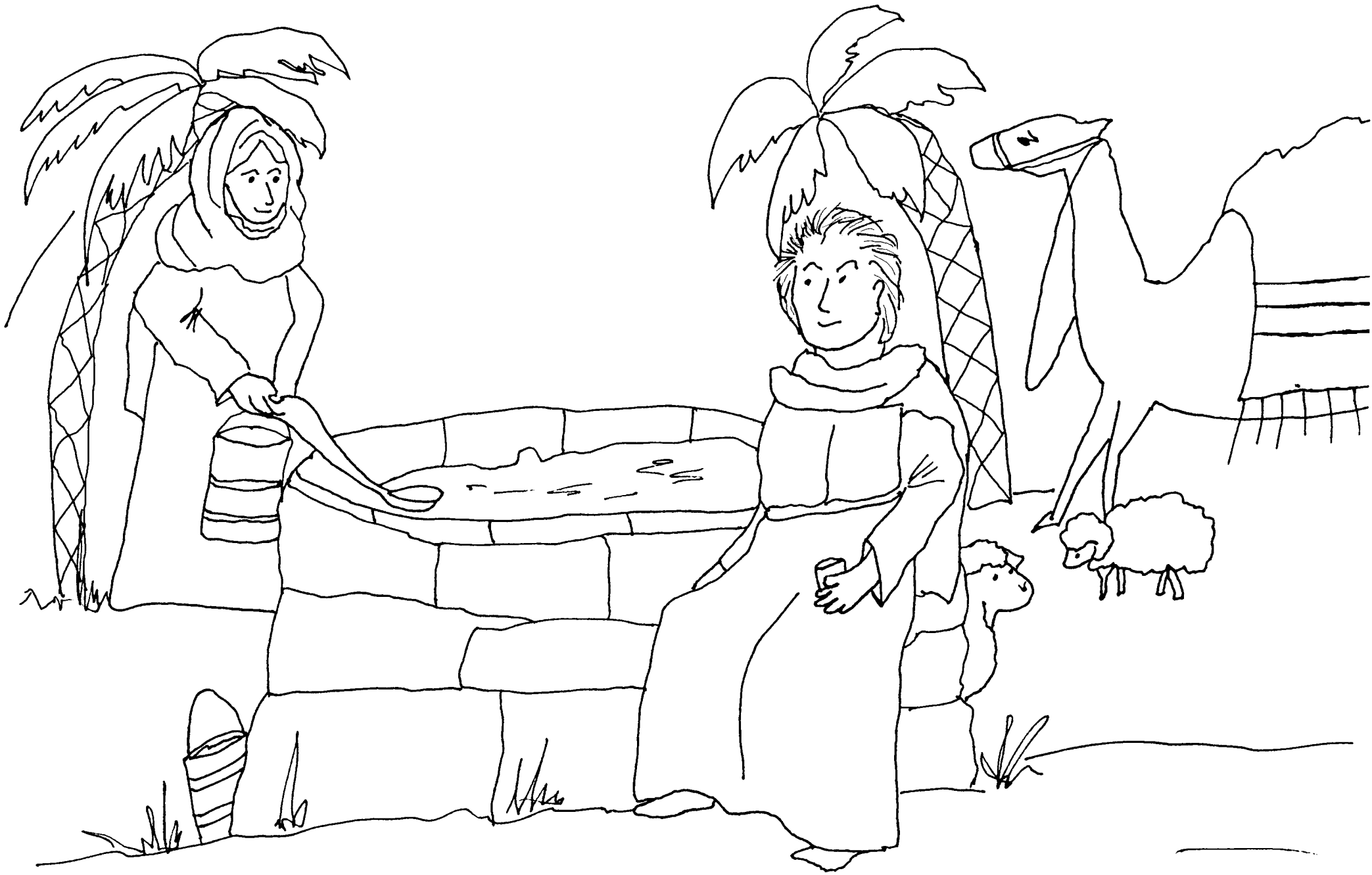
Jacob met his cousin, Rachel, at the watering well.