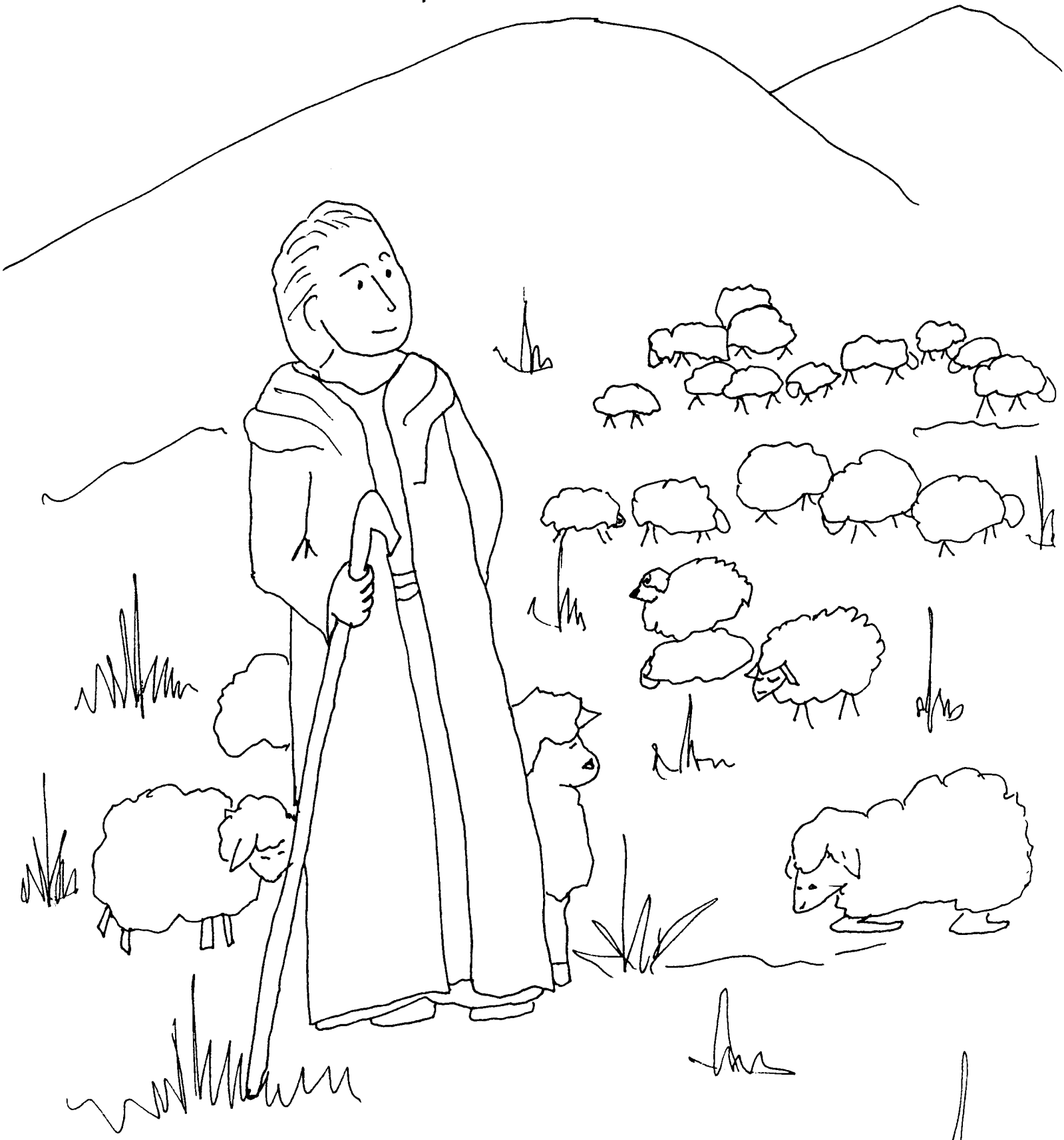
Jacob worked as a shepherd for his uncle Laban so that he could marry Rachel.